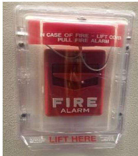
FIRE ALARM PULL STATION