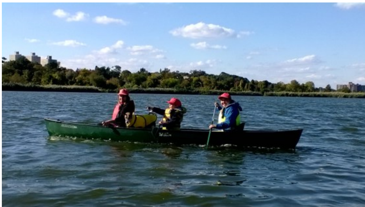
Interspecies fun on Willow Lake in Flushing Meadows-Corona Park.

Starting in June we'll offer paddling the first Sunday of each month . We offer both Partner Paddles to augment the missions of schools and community organizations, and Community Paddles for the general public to enjoy during open program hours.