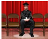
11 Public Universities with the Worst Graduation Rates (The Fiscal Times)