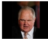
Limbaugh, Hannity & Palin nose-dive