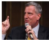
Mayor de Blasio? Start to envision it