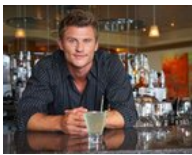
13 Things Your Bartender Won't Tell You (Reader's Digest)