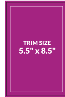
INSIDE FRONT AND BACK COVER 5.75" x 8.75"